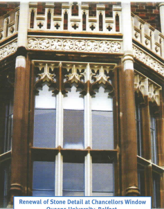
Renewal of Stone Detail at Chancellors Window Queens University, Belfast, For Consarc, Arch.