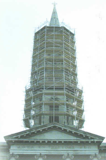
Portland Stone Conservation St. Georges